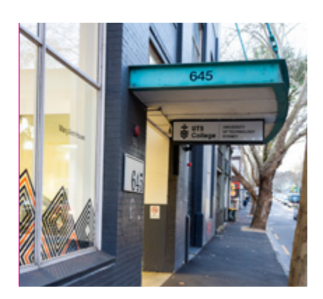
Classrooms and Student Common Area