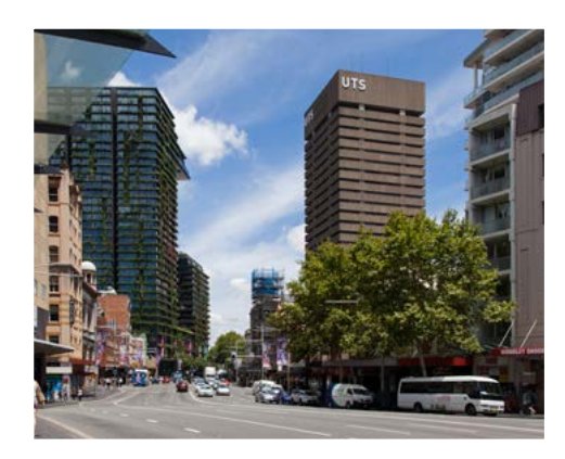
UTS Tower Building (CB01) 15 Broadway, Ultimo

UTS Prayer Room (Level 3) UTS Health Services (Level 6)