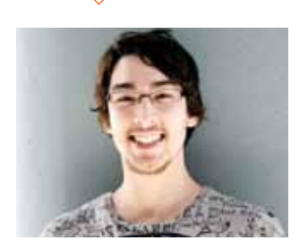
Pathway: UTS:INSEARCH Diploma of Engineering, UTS Bachelor of Engineering Diploma in Engineering Practice (majoring in Information and Communication Technologies)

"My experience at UTS:INSEARCH has been great. Not only have I met a lot of people from lots of different backgrounds, I've also learnt a lot from studying at UTS:INSEARCH. I'll never forget my time here. Everything from the weekly Student Council activities, to the staff members who are willing to help out even after hours.