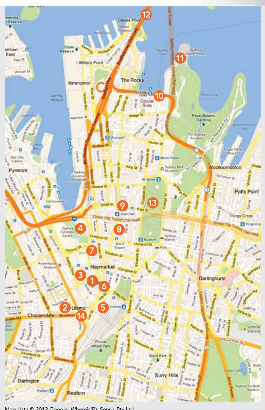
Map data © 2012 Google, Whereis(R), Sensis Pty Ltd