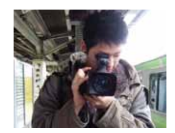
Pathway: UTS:INSEARCH Diploma of Communications, UTS Bachelor of Communications (majoring in Media Arts and Production)

"The tutors and lecturers I had at UTS:INSEARCH were the best - they were very helpful and having access to their expertise was one of the great things about studying there. The curriculum that we were taught also gave me a very strong foundation for my studies at UTS. I felt that I was very well prepared to make a successful transition into my university studies. I really recommend UTS:INSEARCH."